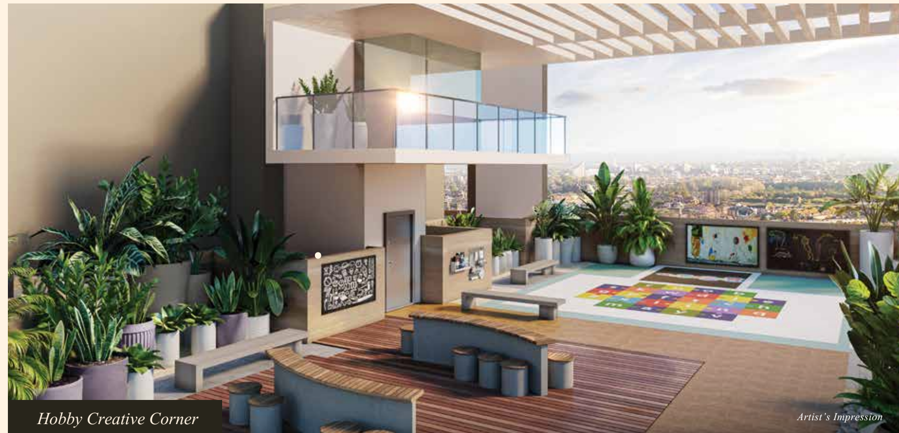
Hobby Creative Corner